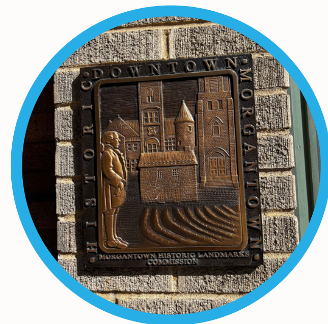
Christian Science Society Historical Plaque

History is all around us! Share photos of your favorite historic buildings and features. #BuildingHistory #LookingUpMorgantown #SavingPlaces