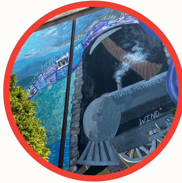
Mural Rail Trail at Historic Train Depot