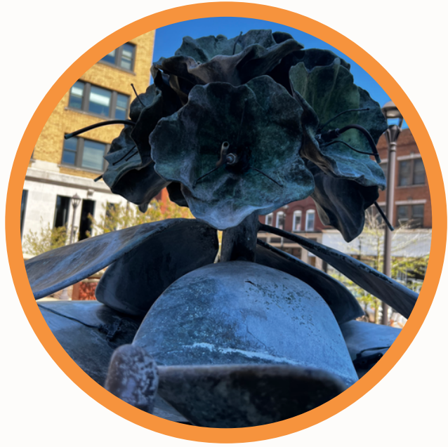
Monongalia County Courthouse Fountain 243 High St.