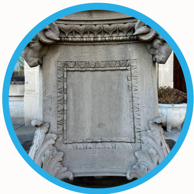
Historic Post Office Lantern (1914) 107 High St.