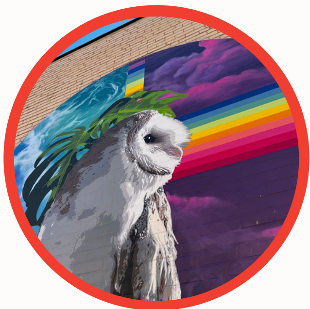
"Trusting the Mystery" Mural (2022) Fayette St.