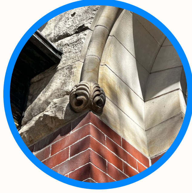
Brock, Reed and Wade Building (1892) 107 High St.